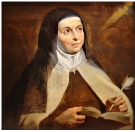
OHM Teresa of Ávila