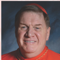
CELEBRANT Cardinal Joseph W. Tobin, C.Ss.R., D.D., Archdiocese of Newark

Cathedral of St. Mary of the Assumption 151 N. Warren Street, Trenton