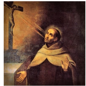
OHF John of the Cross

With zeal have I been zealous for the Lord God of hosts. 1 Kgs 10:19