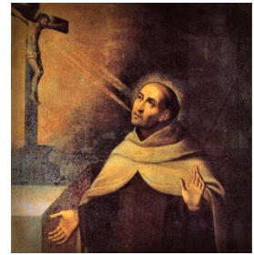
OHF John of the Cross

With zeal have I been zealous for the Lord God of hosts. 1 Kgs 10:19