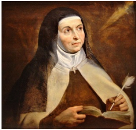
OHM Teresa of Ávila