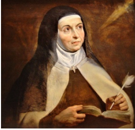
OHM Teresa of Ávila