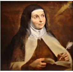
OHM Teresa of Ávila