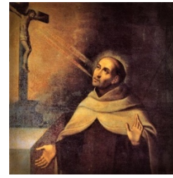
OHF John of the Cross

With zeal have I been zealous for the Lord God of hosts. 1 Kgs 10:19