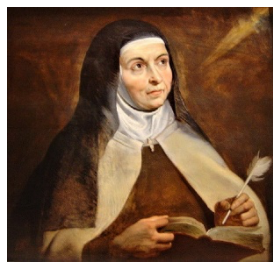
OHM Teresa of Ávila