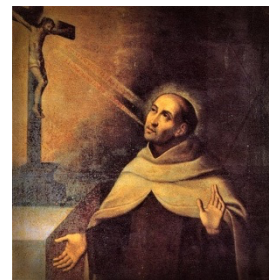
OHF John of the Cross

With zeal have I been zealous for the Lord God of hosts, 1 Kgs 10:19