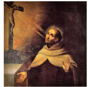
OHF John of the Cross

With zeal have I been zealous for the Lord God of hosts. 1 Kgs 10:19