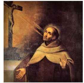
OHF John of the Cross

With zeal have I been zealous for the Lord God of hosts. 1 Kgs 10:19