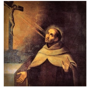
OHF John of the Cross

With zeal have I been zealous for the Lord God of hosts. 1 Kgs 10:19