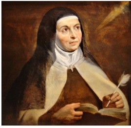
OHM Teresa of Ávila