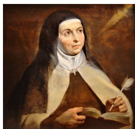
O.H.M. Teresa of Ávila