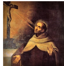
O.H.F. John of the Cross

With zeal have I been zealous for the Lord God of hosts. 1 Kgs 10:19