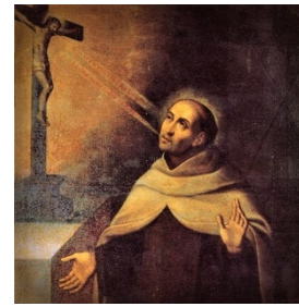
OHF John of the Cross

With zeal have I been zealous for the Lord God of hosts. 1 Kgs 10:19