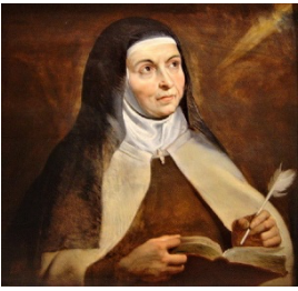
OHM Teresa of Ávila