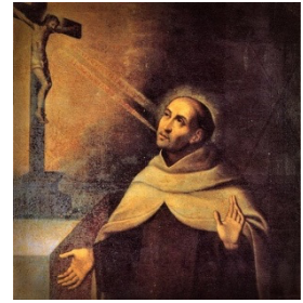
OHF John of the Cross

With zeal have I been zealous for the Lord God of hosts. 1 Kgs 10:19